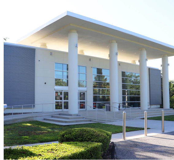
Osceola Library System