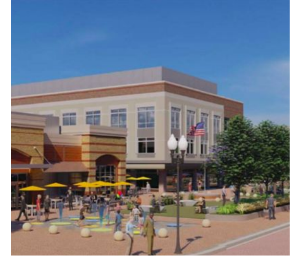
Manassas Park City Library