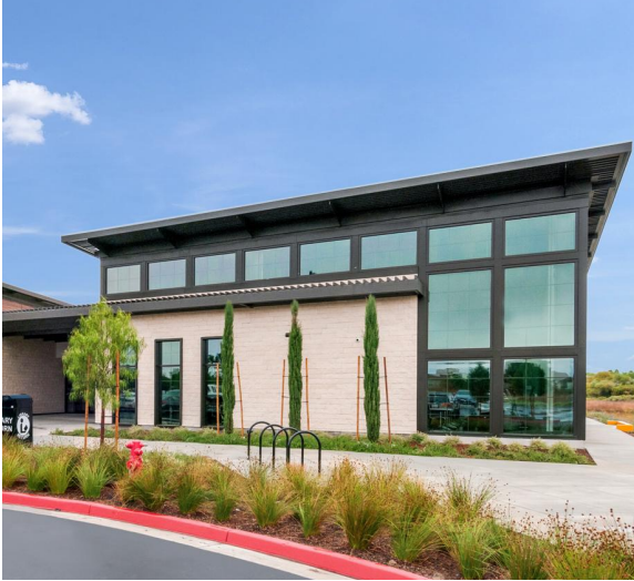
Riverside County Library System